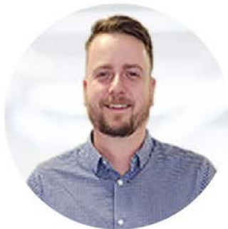
Business Development Director