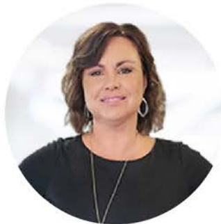
Business Development Assistant